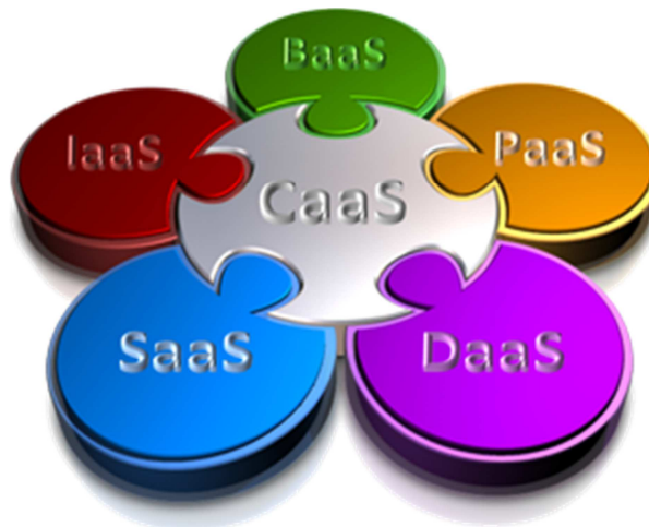
Fig. 1. Types of cloud computing

The cloud has made a tremendous maturity for the mobile environment because it allowed him to use powerful resources beyond their performance, such as storage, hardware (RAM, CPU) and network. The cloud mobile users can use multiple services on demand according to their needs: [5]