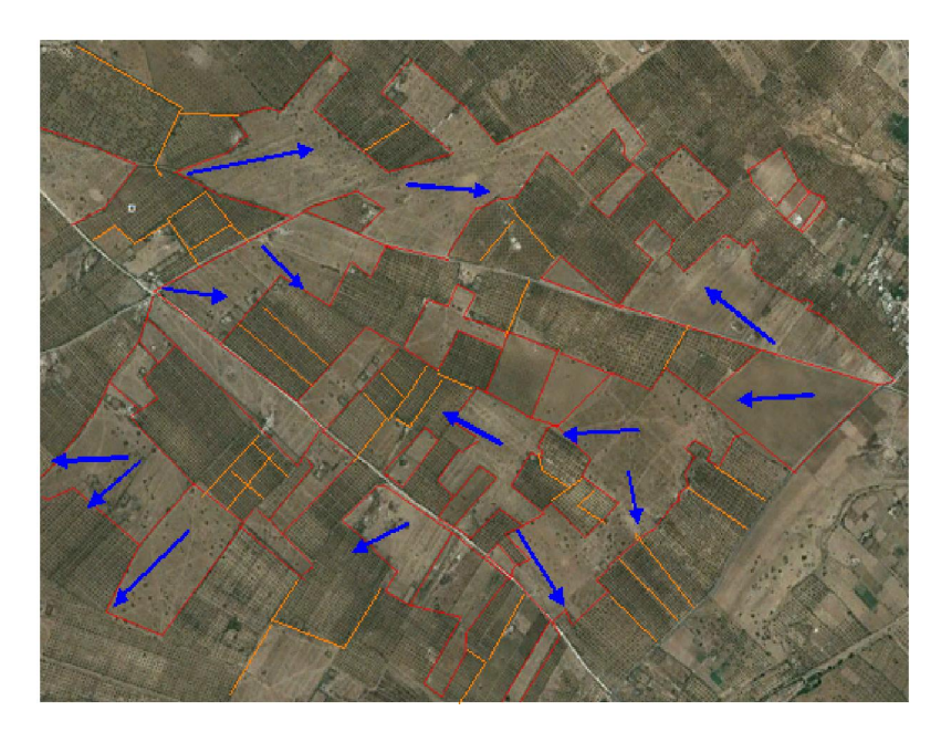
Fig. 3. Over view of Meskats and their landscape integration