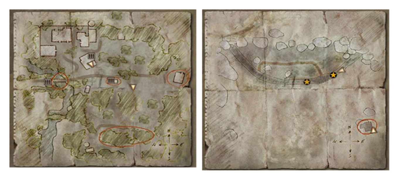
Fig. 1. Land Distribution Pattern before and after SIDR

From the above figure it has been clarified that the total displaced land whereas the left sided map represents the land distribution pattern before cyclone SIDR and the right sided map represents the land distribution pattern after cyclone SIDR.