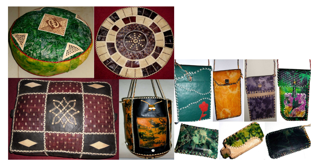
Fig. 9. Puffs, mat & utility carrier