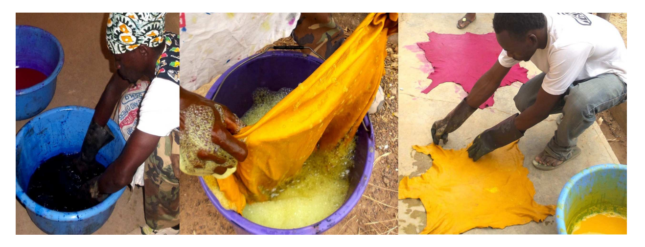
Fig. 3. Dyeing of leather (left), Washing of leather (middle) and Drying of leather (right)