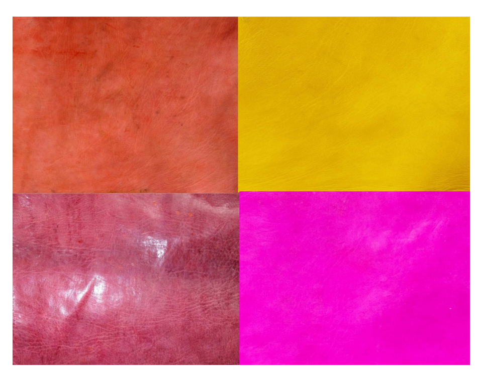
Fig. 6. Selected single-solid colour dyed leathers