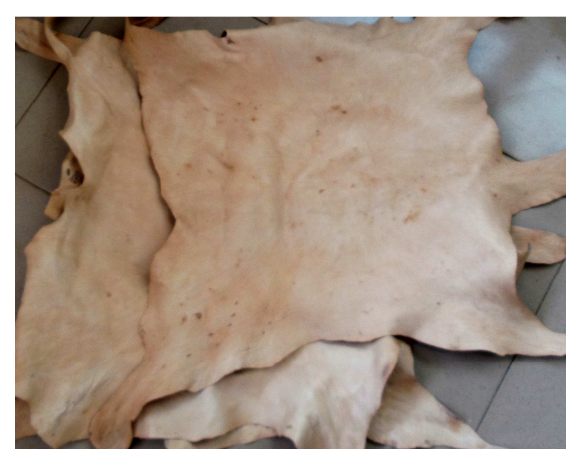
Fig. 1. Crust leather

The two main dyeing methods used to impart colour to the vegetable tanned leathers were the immersion and pouring techniques. Patterns were effected into the leathers using the scrunching (crumpling) and tie and dye techniques. The third varieties of leathers were however dyed into assorted single-solid coloured hues. Details of the various methods employed during the experiment are captured below.