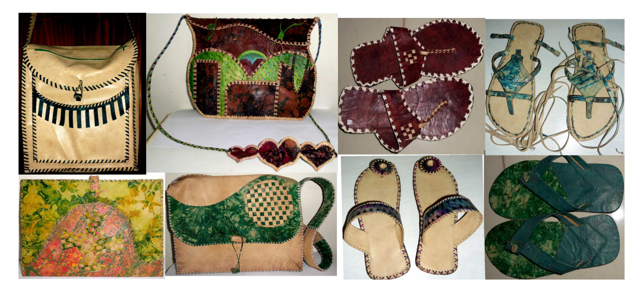
Fig. 7. Assorted bags