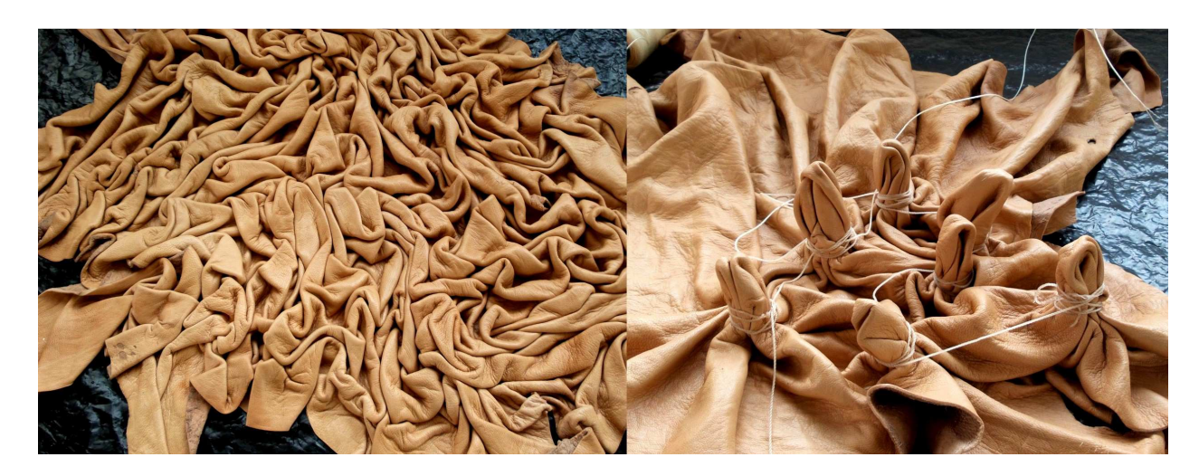
Fig. 2. Scrunched leather (left) Tied leather (right)