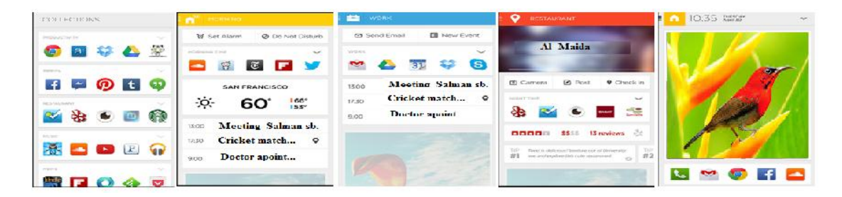
Fig. 3. Device a contextual based interface adaptation capabilities

We conduct experiment with two different types of handheld devices. One of the devices provides static user interface named device 'A' and second provide context aware adaptable interface named device 'B'. For context aware adaptation we used android context Aviate screen [17]. We repeat the same experiment with both types of devices.