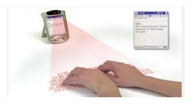
Fig. 2. Canasta Key board [14]

Due to multiple focus of HCI research there is also trend in multimodality interfaces from traditional interfaces. Along with shift from traditional to multimodality there is also trend of intelligent, context aware, adaptive interface with implicit human computer interactions rather than explicit interaction pattern through command line and GUI interfaces. Multimodal interaction should be focus of HCI in future. Multimodal interfaces offer additional models like dialogue, gesture and context of use. Challenge is to identify what task fit to what modality. Human to human communication is an ideal standard for future multimodal interactions in Ubiquitous computing [5].