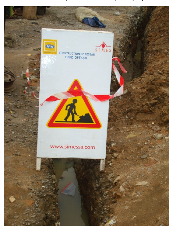
Figure 4: The building of an optical fibre network

It is worth noting that the State is not the only to unfold the optical fibre. Private operators also install their optical fibres. Figure 4 shows the building of an optical fibre network by a mobile telephony operator MTN in Abidjan.