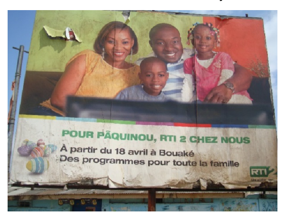
Figure 5: An annunciator poster about the advent of RTI 2 in Bouaké

(TNT) by the International Union of Telecommunications (UIT). This concession amounts to 48 channels for the unfolding of its frequencies. If a channel contains twenty (20) programmes, therefore let us imagine how many programmes Côte d'Ivoire will have [12]. Until a recent date, RTI 2 which broadcasted only in the vicinity of Abidjan and on Canalsat, has taken up an ambitious project of space conquest. This initiative put an end to decades of hegemony of RTI 1 and the monotony in the broadcasting of information for populations who cannot subscribe to Canalsat. Now, RTI 2 is present in regional capitals and the cities in the interior of the country. Since 18<sup>th</sup> April 2015 RTI 2 broadcasts in the town of Bouaké (see Figure5) and its surroundings within a radius of 90 kilometres [13]. The city of Bouaké is the second densely populated city after Abidjan. It is also the second city the most provided in industrial infrastructures after Abidjan.