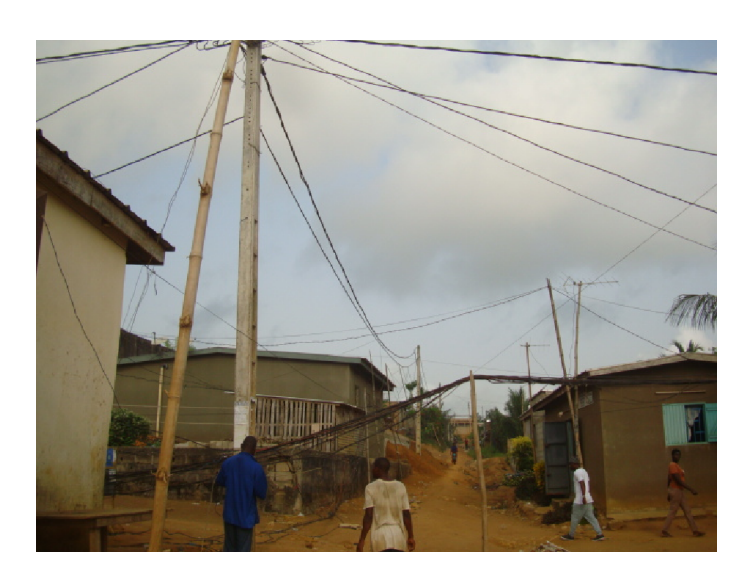
Figure 3: anarchic connections of electric cables

The illicit sale of the electric energy is a real danger for populations. It causes the presence of electric cables in the environment, and sometimes in the streets of quarters after the coming of a storm. Figure 3 points out the disorder engendered by cables in Adiopodoumé (Kilometre 17), a village located at some kilometres from Abidjan.