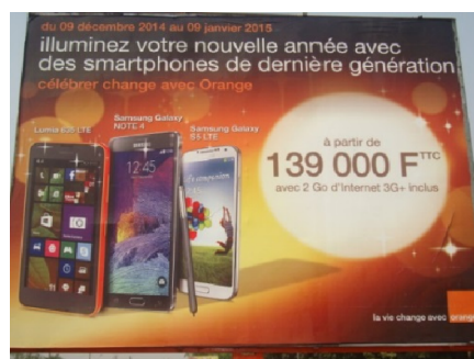
Figures 1&2: Advertisement posters