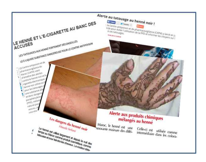
Figure 4: Awareness articles in Moroccan press