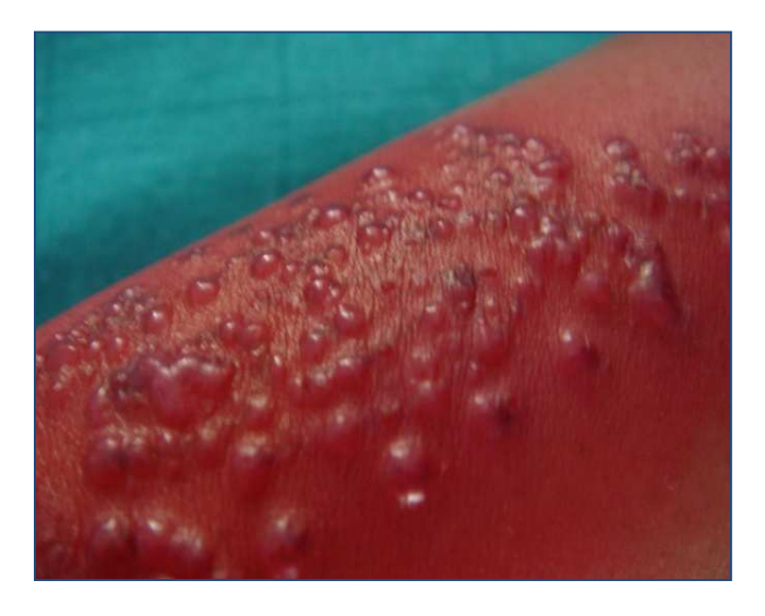
Figure 2: Patient's forearm bullous dermatitis