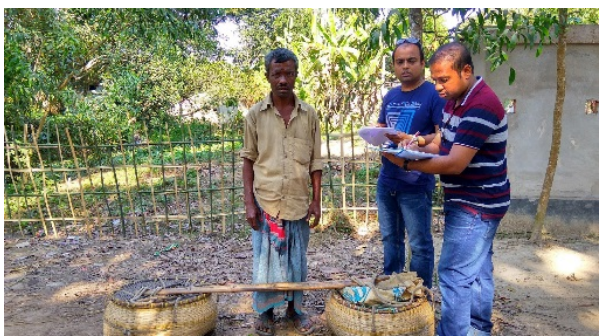
Fig. 5. street shoemaker and mobile hawker