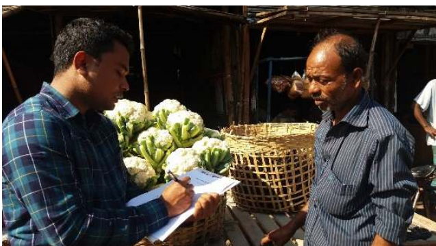
Fig. 3. Street vendor is selling beetle nut and vegetables

It has been found that vendors work in two shifts daily. Thus, the actual employment generation is almost double against vendors included in this study. In this study, we surveyed at designed type market, as well as un-designed and mobile shop as well. We found various types of vendors in those markets who were financially independent, dependent and semi dependent. We also found the vendors who were involved in selling perishable goods, non-perishable and providing services.