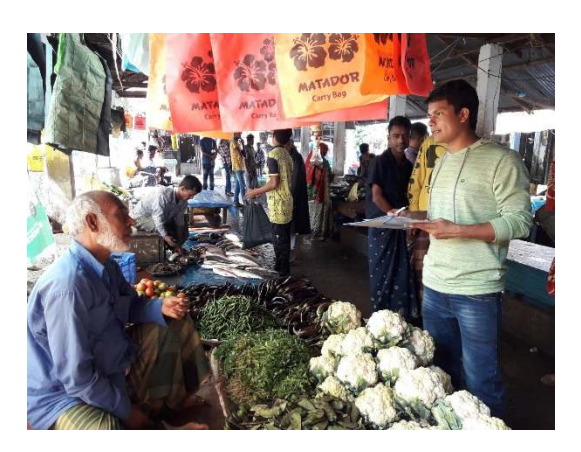
Fig. 4. Street vendor selling banana, apple, other fruits and vegetables

Vendors purchase their ingredients in large quantities and in cheapest market. So, street vending requires less cost as they serve several consumers [35].