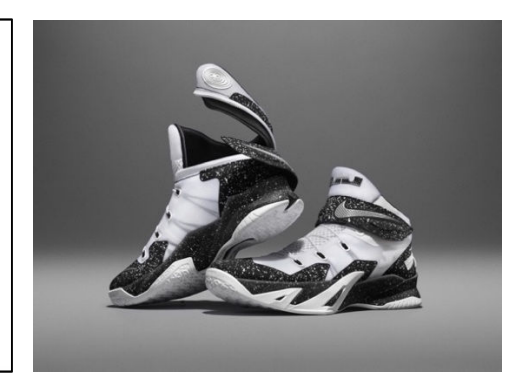
Fig. 3. FlyEase - Nike

"This is an unbelievable story that we get to keep rewriting," adds James, whose Zoom Soldier 9 will also include a FlyEase silhouette when it debuts later in 2016. "Kids should be on the move, and we have the opportunity to accelerate that with the FlyEase collection."