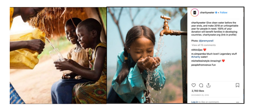
Fig. 6. Instagram posts showing how photography can be used in narrative — Charity water