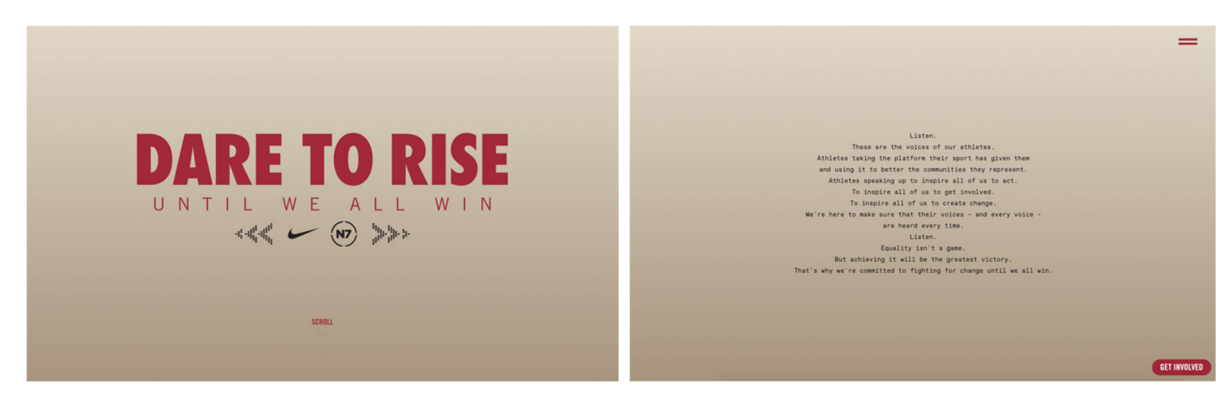
Fig. 1. Equality campaign- Nike

Nike created one of the best storytelling campaigns as it always excelled by putting a strong statement introducing the brand as a force for changing society positively. A successful example of engaging audience through a relevant story. It encouraged consumer just through wearing Nike products or engaging in social media to be a part of its movement [2]. In 1999, Nike released a TV commercial to celebrate Michael Jordan Career Fig. 2 giving a model to follow in leveraging meaningful storytelling in building the brand, although the brand name didn't mentioned until the last second. In the time when everyone was focusing just on selling and there wasn't any online commercials.