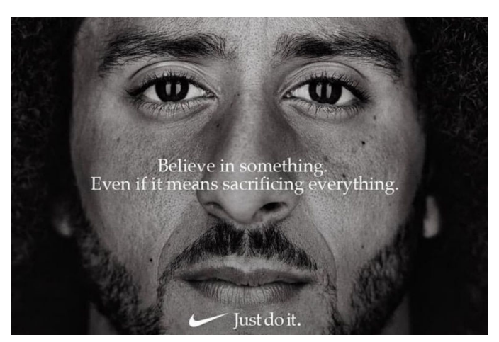
Fig. 4. Colin Kaepernick ad - Nike

One of the most significant things in this project is that Nike gave people the voice to tell their own stories rather than telling the brand stories [23]. In 2017 Business Insider published that Colin kaepernick isn't the first ad for Nike to make a social statement [31].