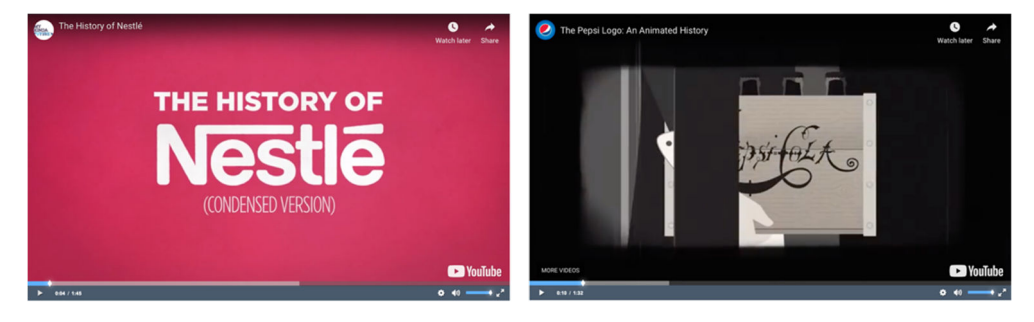
Fig. 7. Videos used for brand storytelling - Nestle and Pepsi cola