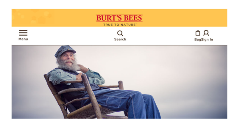
Fig. 5. The official website: the image reflects the storytelling of Burt Shavitz x - Burt's Bees

Burt Shavitz has been a role model to Burt's Bees Fig. 5. (personal care products), and encouraged them to live a simple, natural, responsible life. As a result of that a giant part of their brand storytelling emphasizes that they take Burt's lifestyle and ideology is an inspiration for the products they make. We are introduced to the guy responsible for the brand, throughout a bunch of sequential amusing videos. For instance, we get to know more about Burt from that mini-documentary. Burt's Bees try to form an honest relationship with their consumers, as clearness means everything at that time [8].