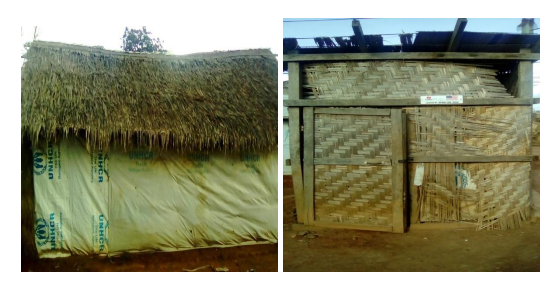
Fig. 2. A dilapidated refugee tent and toilet on the camp of Gado

Source: by, Vanessa M. Kehdinga Gado Badzere, 24-05-2018