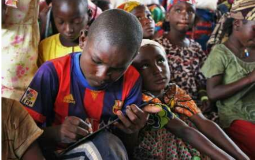
Fig. 3. An overcrowded classroom in the East region of Cameroon