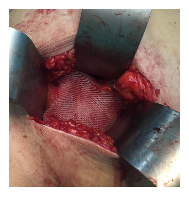
Fig. 3. Intraoperative image showing the placement of polypropylene mesh at the weak spot