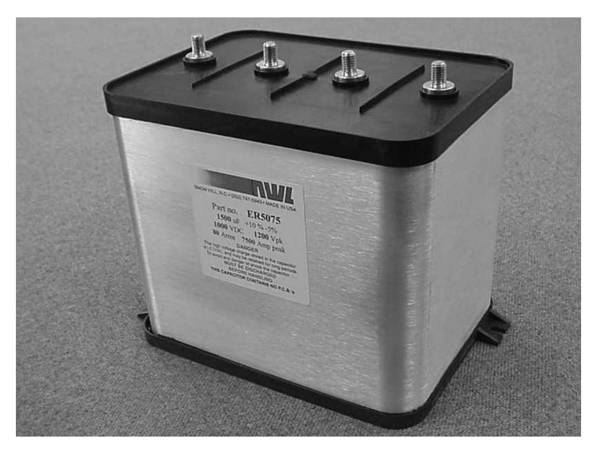
Fig. 2. NWL ER-SERIES dry capacitor using segmented HCPP film

One of the previous limitations for metallized polypropylene was that it was only available in thicknesses such as 4\mu m and above. In the 1990's, 3.5 \mu m polypropylene was available yet not common. With the improved mechanical properties of HCPP such as greater rigidity, film in the range of 3.0 \mu m thick is available in industrial quantities. The applications for these thinner materials include high volume products such as hybrid electric automobiles. As the film and capacitor production procedures for these higher volume applications are refined, the comparisons between metallized film and other capacitor technologies will change again.