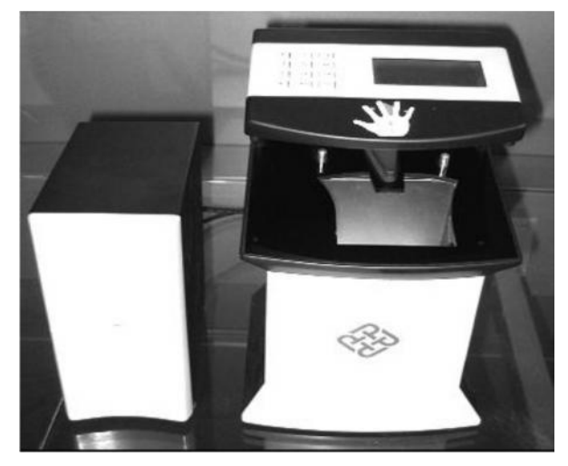
Fig. 2. CCD based palm print scanner

There are various palm print acquisition devices used by various researchers like CCD based palm print scanners, digital cameras, video cameras, digital scanners etc. CCD based palm print scanners have pegs for guiding the placement of hands. Fig.2 shows CCD based palm print scanner. CCD camera contains of a set of optical components which work together to obtain the data from the palm. Digital scanner takes more time to scan the palm image and hence cannot be used in real time applications. Images captured with digital and video cameras may contain distortions and might cause recognition problem as they collect images in uncontrolled environment. Fig.3 shows the palm images taken from CCD based palm print scanner and digital camera.