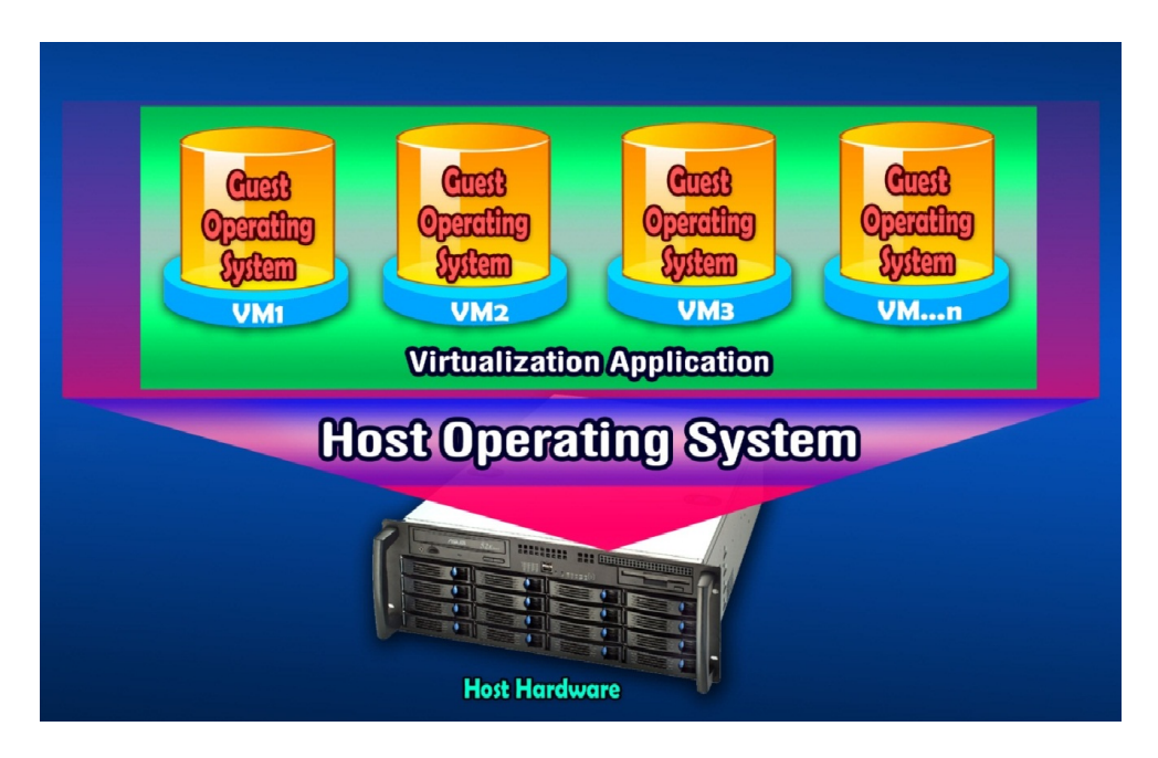
(a) Operating system-based Virtualization

In a traditional environment consisting of physical servers connected by a physical switch, IT organizations can get detailed management information about the traffic that goes between the servers from that switch. Unfortunately, that level of information management is not typically provided from a virtual switch. Basically, the virtual switch has links from the physical switch via the physical NIC that attaches to Virtual Machines. The resulting lack of oversight of the traffic flows between and among the Virtual Machines on the same physical level affects security and performance surveying. There are several common approaches to virtualization with differences between how each controls the virtual machines. The architecture of these approaches is illustrated in Figure 1