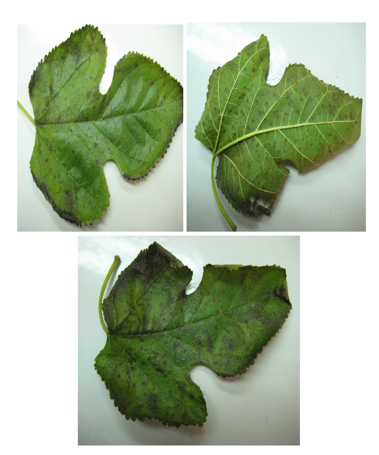
Figure 2: Developed lesions on leaves of Morus sp., inoculated with the sporale suspension of Drechslera australiensis.