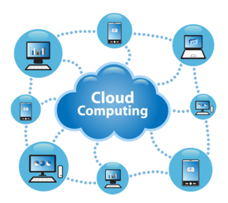
Fig.1. Cloud Computing

NIST - National institute of standard and technology describes the cloud computing as "a model for enabling ubiquitous, convenient, on-demand network access to shared pool of configurable computing resources (e.g. networks server, storage applications. And services) that can be rapidly provisioned and released with minimal management effort or service provider interaction" [1]. The cloud is being seen as important and vital in the IT industry as time goes on and will impact more on information technology for the society. Cloud infrastructure is mainly relay on deliverable service those are based on servers with different levels of virtualization technology.