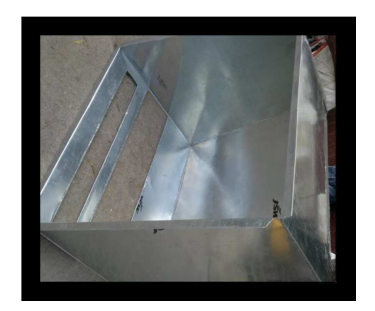
Fig. 5.2 Sheet Metal Work