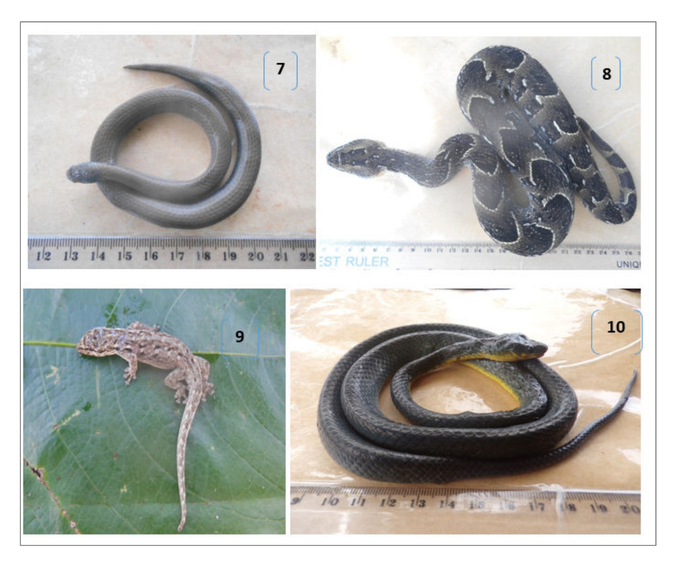
Fig. 3. Some of the reptile species caught in the RAFALE landscape Cnemaspis sp (1), Trachylepis quinquetaeniata (2), Python sebae (3), Trachylepis sp (4), Philothamnus angolensis (5 and 10), Thelotornis kirtlandii (6), Duberria sp (7), Bitis arientans (8), Lygodactylus sp (9).