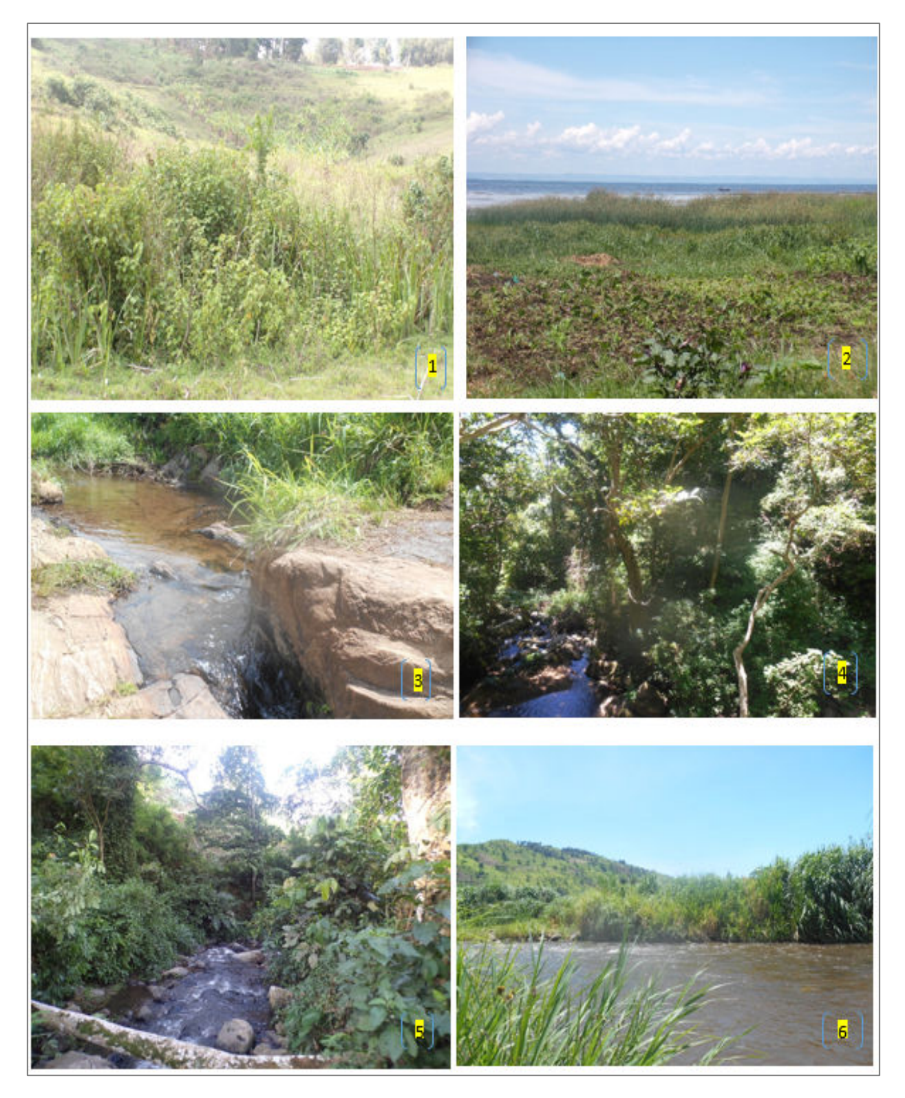
Fig. 1. Sites for amphibians and reptiles 1. ISPT shallows, 2 and 6. Lake Albert, 3. Dzu, 4. Dzoo and 5. Nzerku 3