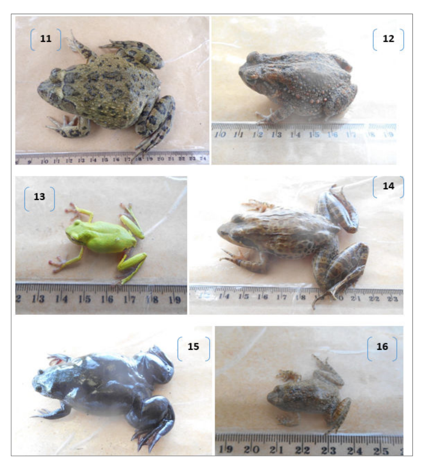
Fig. 2. Selected amphibian species caught in the RAFALE landscape: Ptychadena cf oxyrhynchus (1), Amietia sp (2, 6, 9 and 14), Amietia angolensis (5), Ptychadena sp (3, 7, 8 and 10), Hyerolius cinnamomeoventris (13), Arthroleptis sp (4 and 16), Hoplobatrachus occipitatlis (11), Sclerophrys sp (12), Xenopus sp (15), Arthroleptis sp (16).